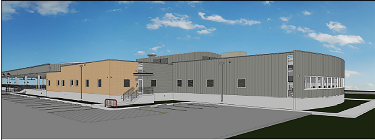
④ INBOUND COMMERCIAL FACILITY EXTERIOR PERSPECTIVE