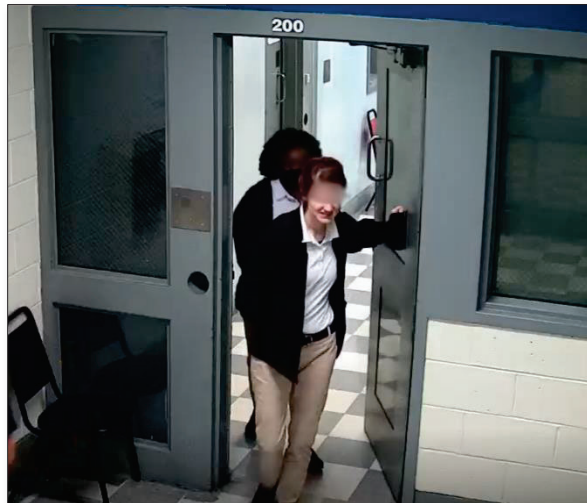
Figures 1 and 2. ICDC staff not wearing masks and not practicing social distancing on February 21, 2021.